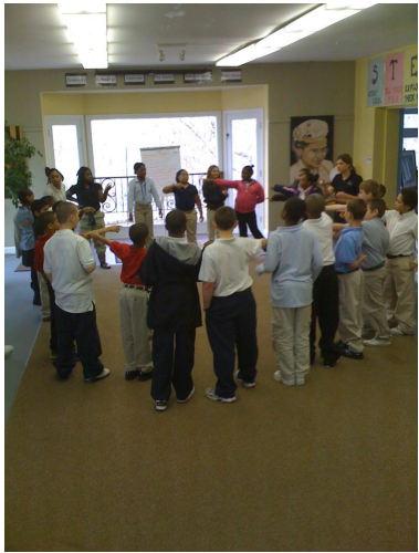
Students at PLC