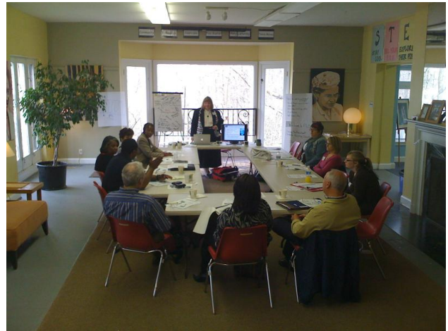
Corporate & Community Program at PLC