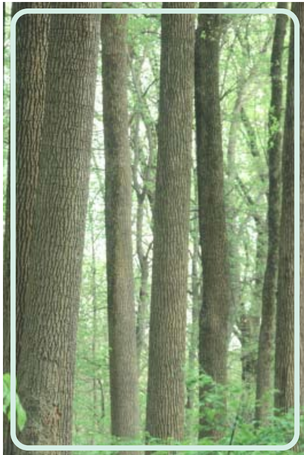
View from the Tall Timbers trail