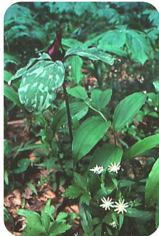
Trillium and chickweed