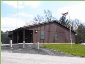
Greene-Sullivan State Forest Office

You are cordially invited to attend our Open House on Saturday, March 3, 2012 from 10:00 a.m. to 5:00 p.m. at the Linton City Park-East Cabin as part of Marsh Madness . No fees will be charged to enter the east cabin.