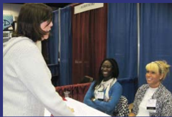
Youth division staffers greet visitors at the IYI Kids Count Conference

provided invaluable information and examined best practices.